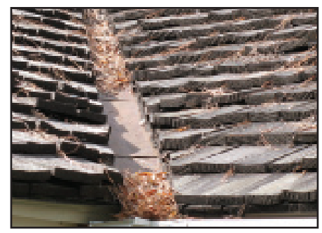
Embers could ignite these needles.