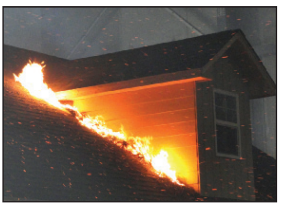
Debris can build up in corners, providing fuel for embers.