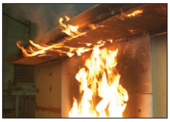
Embers from flames can find their way into your attic through unscreened vents.

Dormers, split-level roofs and lots of nooks and crannies create the perfect nest for burning embers. Pay particular attention to any and all inside corners. Wherever possible, cover those corners. Metal flashing is very effective.