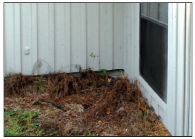
Inside corners can harbor embers.

Visualize if there is anything that can burn easily. Look for the little things: Dry grass growing up against or leading to the foundation, dead vegetation underneath bushes and shrubs, a woodpile next to the home or on the deck, patio furniture cushions, etc.