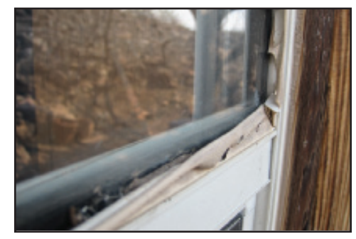
Embers landed on this window.