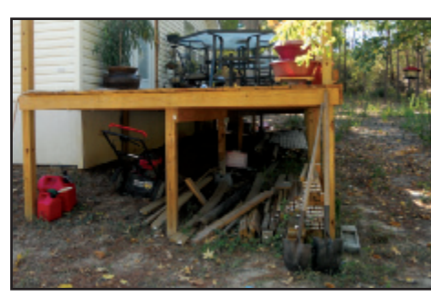
Embers landing on this wood could set your deck on fire.