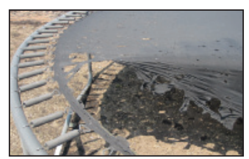
Embers destroyed this trampoline.