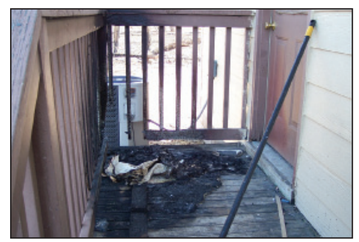
This photo shows damage to a wooden deck from embers.